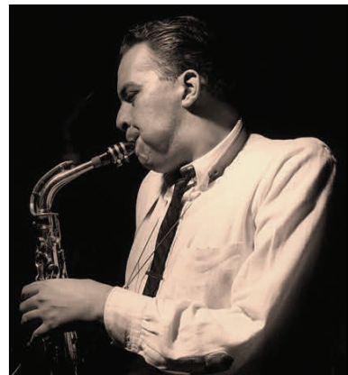
Just Jazz Artist of the Month alto saxophonist Jackie McLean